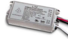
75W Dimmable Driver