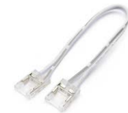
PCB Jumper Cable | 8in (203mm) IP20 #061082