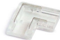
L Splice Connector IP20 #061084

Specifications may be modified or improved without notification