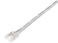
PCB Starter Cable | 16ft (4.8m) IP20 #061081