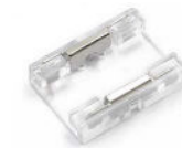
PCB Inline Connector IP20 #061083