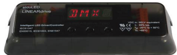
LINEARdrive DC Series