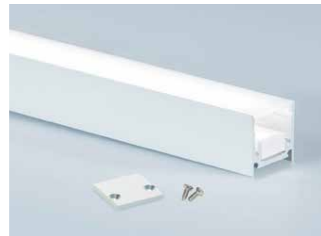
Example OrgaLED® Aeris IP40

Walk-over profiles available on request.