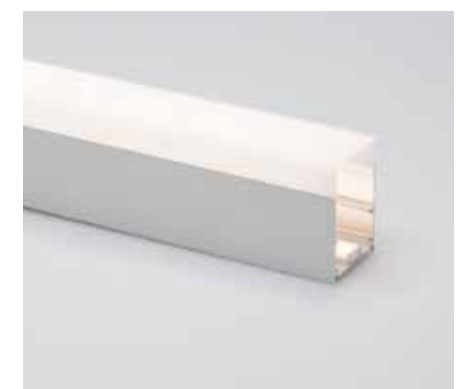
Diffuse high lens