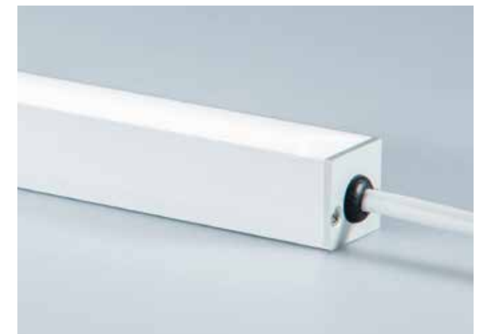
Example OrgaLED® Aeris IP67 11