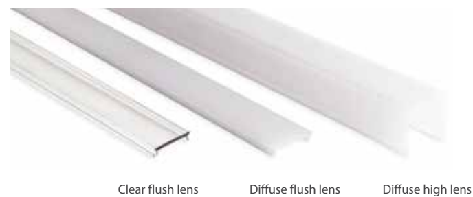
Clear flush lens

The OrgaLED® Aeris range is complemented with various cover and mounting accessories. Depending on the required light effect, the profiles can be equipped with a clear (low) or diffuse (low/high) cover. The higher the profile and cover, the more diffuse the light effect will be.