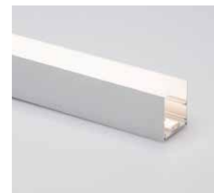
Diffuse flush lens