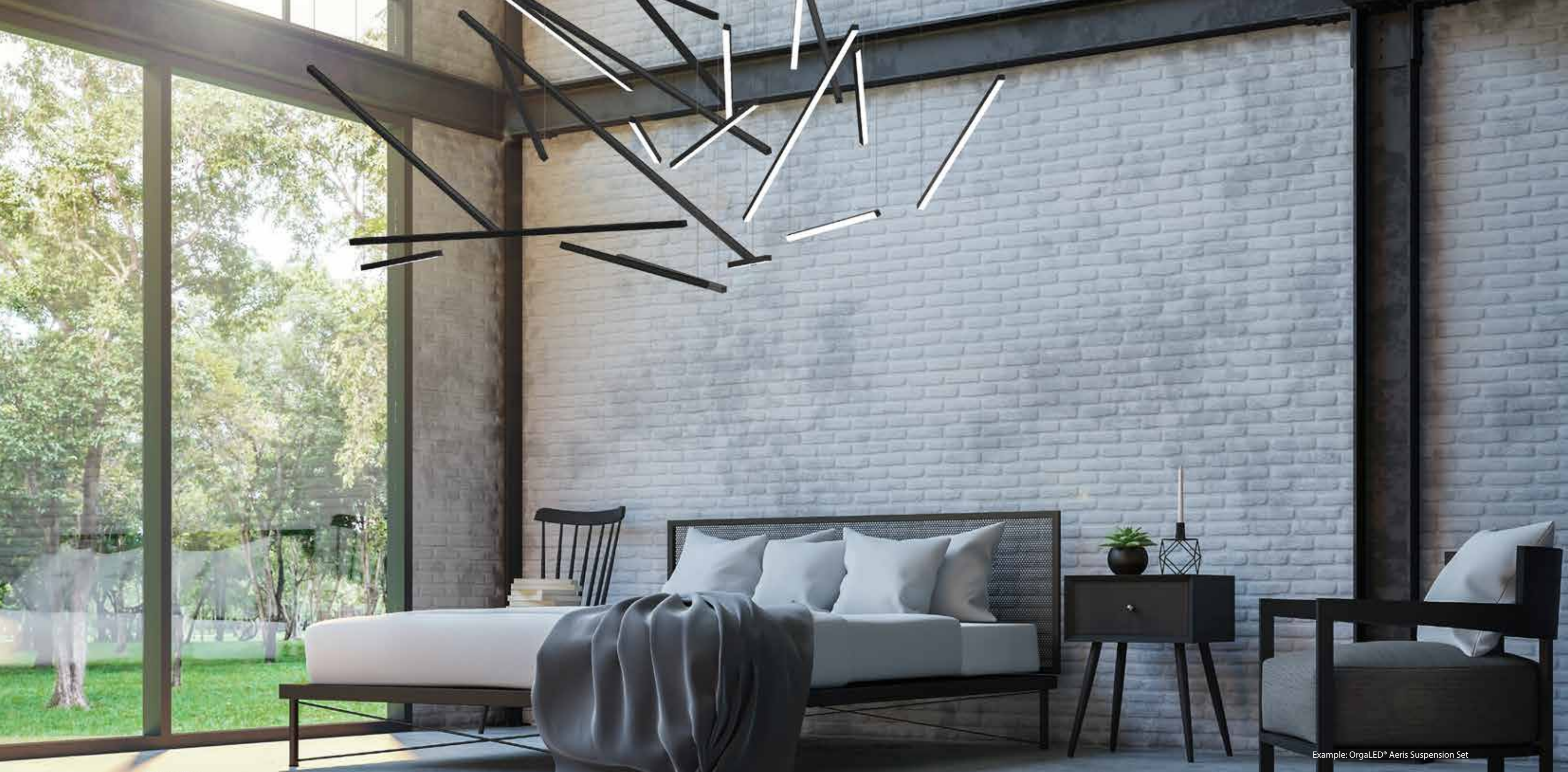
Example: OrgaLED® Aeris Suspension Set