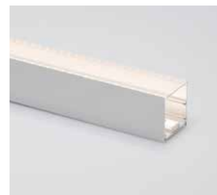
Clear flush lens