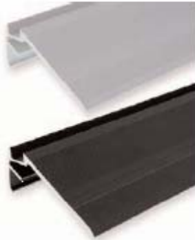
Direct view with angled bullnose edge

Finely detailed aluminum extrusion with non-slip tread patterns support liniLED securely in the captive groove. Supplied in various lengths for field cutting and drilling.