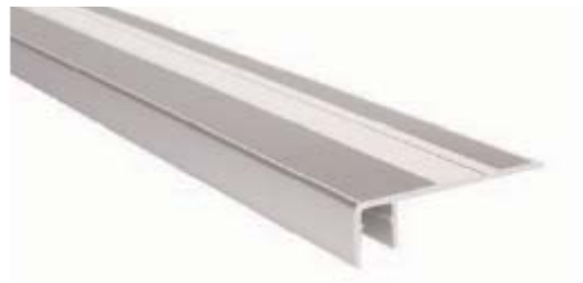
Indirect bullnose non-slip non-slip tread